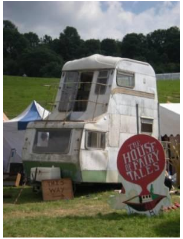
Caravan photographed at Glastonbury this year