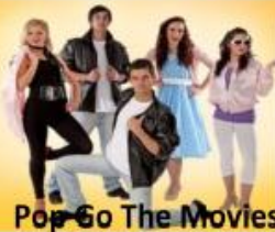
Pop Go The Movies