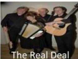
The Real Deal